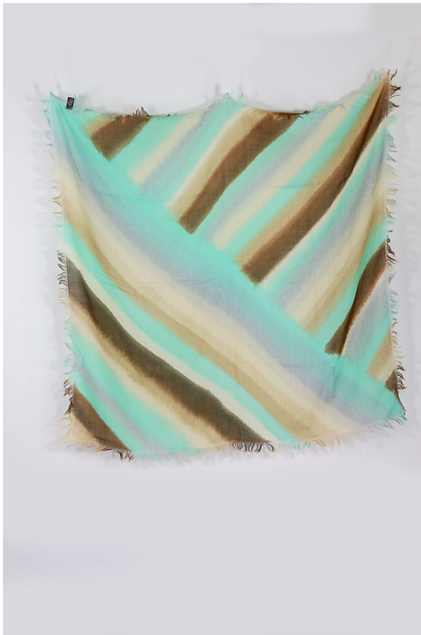
Foulard lana bio