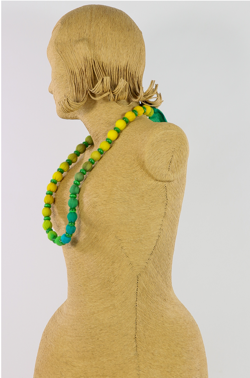
Collana lana bio