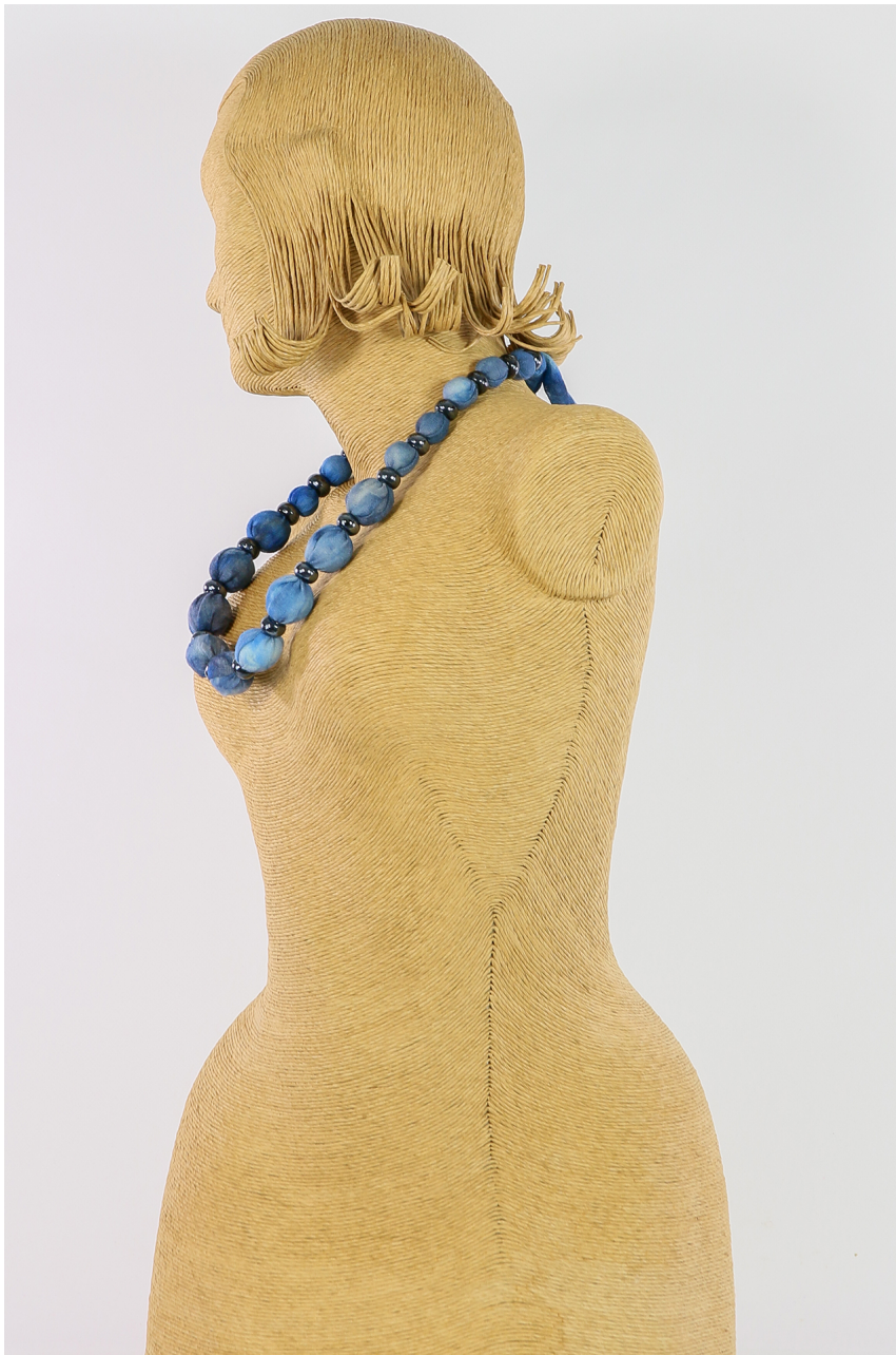
Collana lana bio