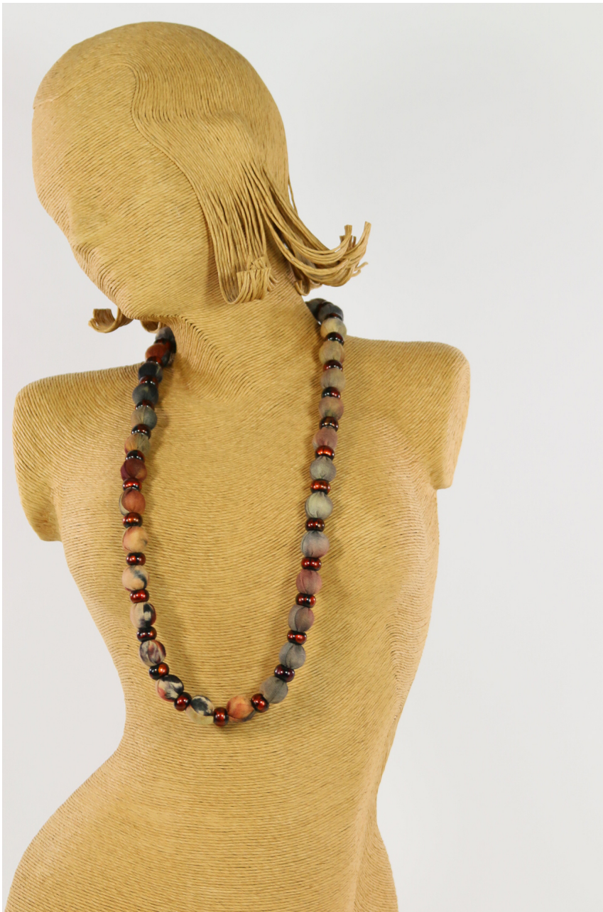
Collana lana bio