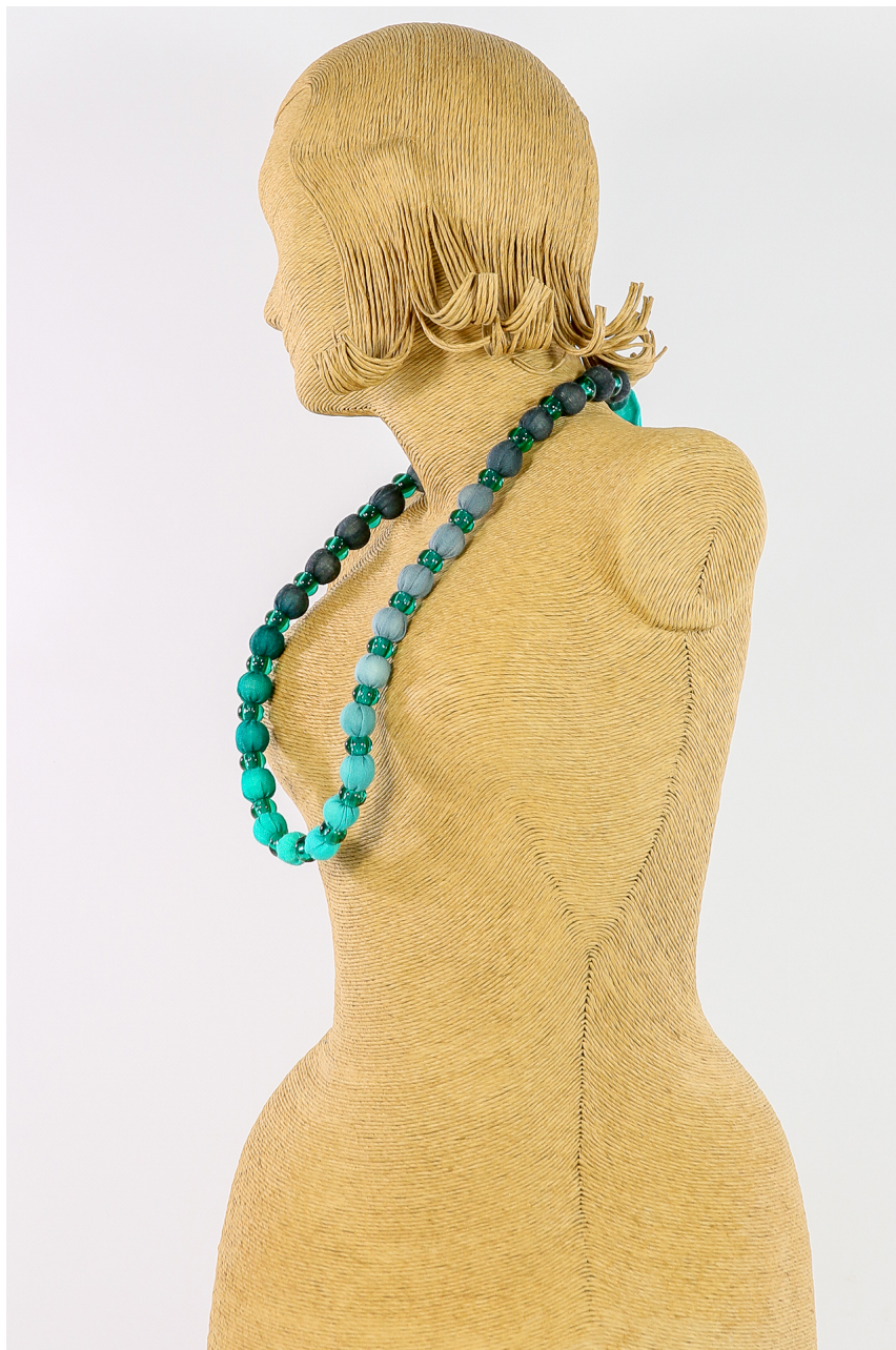
Collana lana bio