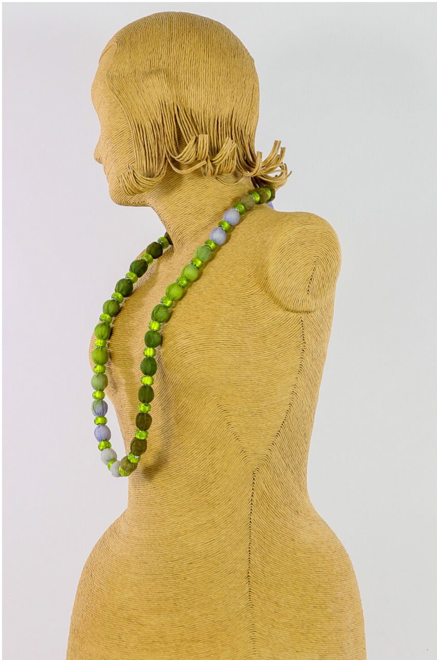
Collana lana bio