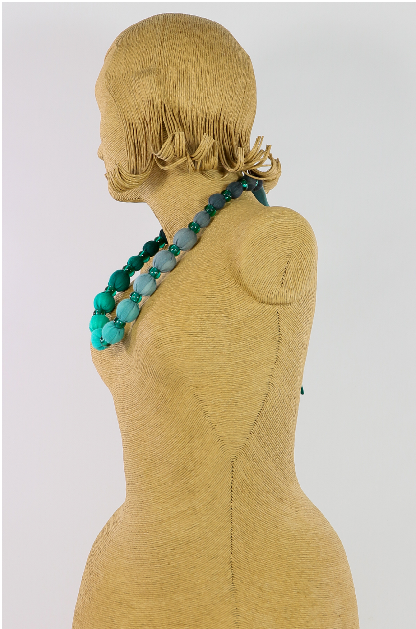
Collana lana bio