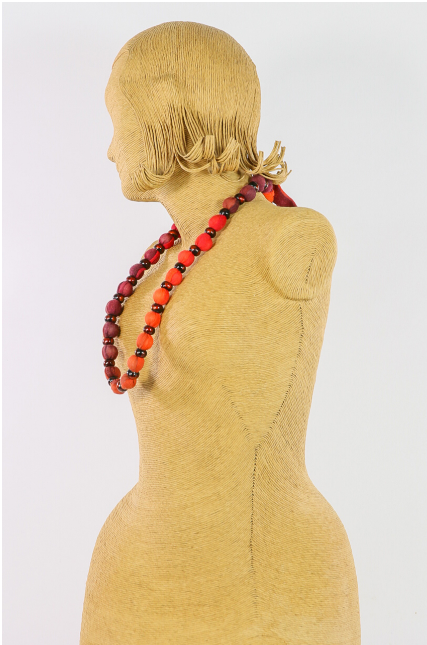
Collana lana bio